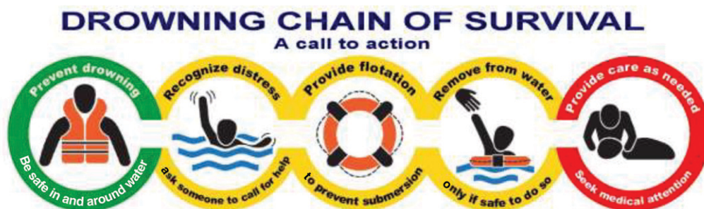
FIGURE 1 Drowning chain of survival. Adapted from Szpilman D, Webber J, Quan L, et al. Creating a drowning chain of survival. Resuscitation . 2014;85(9):1151.

underscores the critically time-sensitive role of the parent or supervising adult in preventing a drowning and stopping it from becoming a fatality.